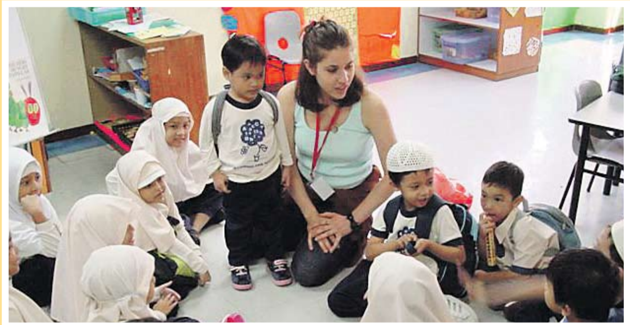
An American student visiting kids at a Jamiyah centre in Singapore as part of an exchange programme.

Jamiyah helped set up the first Inter-Religious Organisation in 1949. It arranged