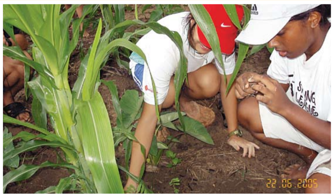
Baha'i Singaporean kids visited a yam plantation in Sabah in 2005 (above) to learn more about farming. Last year, Bahai'is helped spread the green message to students taking part in an international summer camp organised by Nan Hua Secondary School (below).

Choose for your neighbour that which you would choose for yourself. – Baha'u'llah